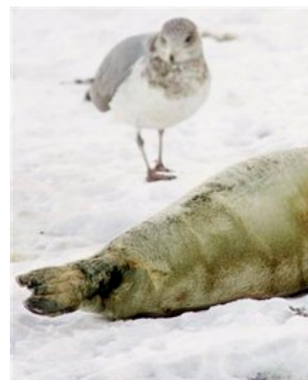
FILE - In this Jan. 27, 2009 file photo, a juvenile harp seal rests on a piece of ice in Boston Harbor, in the Maritime Provinces of Canada. The seal was found on pack ice in the Maritime Provinces of Canada, the coast of the Northeast United States. But the usual number of harp seal sightings in 2011 is clear explanation why.

But those numbers are piddling compared to the number of harp seals found in the northwest Atlantic. Canada's